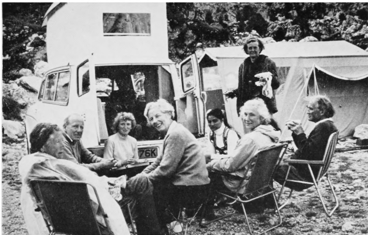
Dolomite Meet 1972